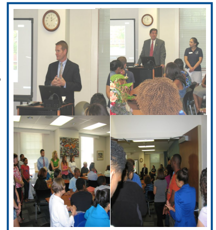
OMA Open House