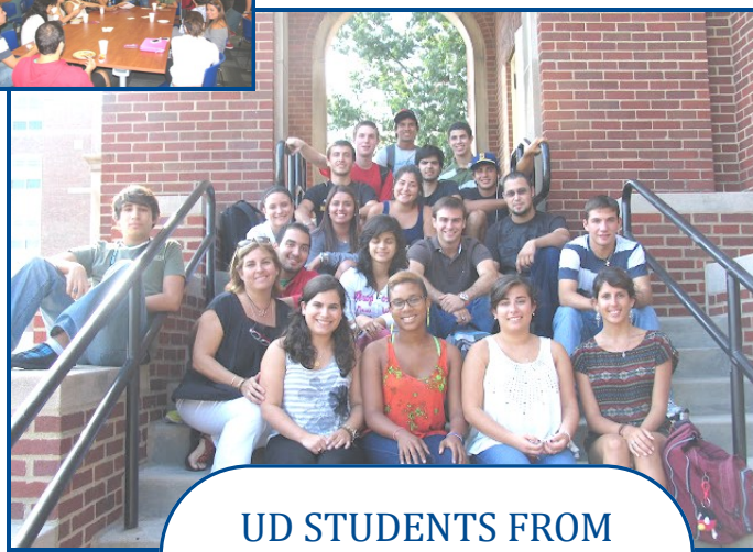
UD STUDENTS FROM PUERTO RICO