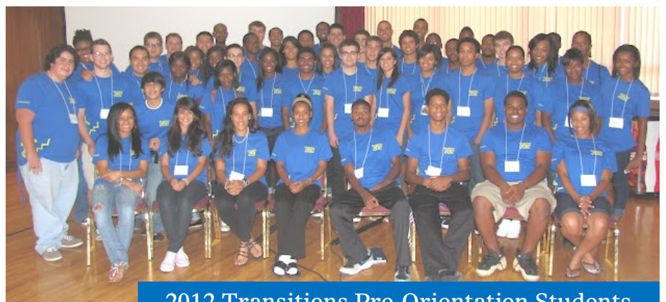
2012 Transitions Pre-Orientation Students